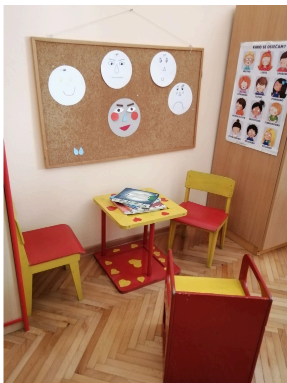
1. conflict corner in the class

Here are two examples of conflict corners in OŠ Ivana Gorana Kovačića Vrbovsko.